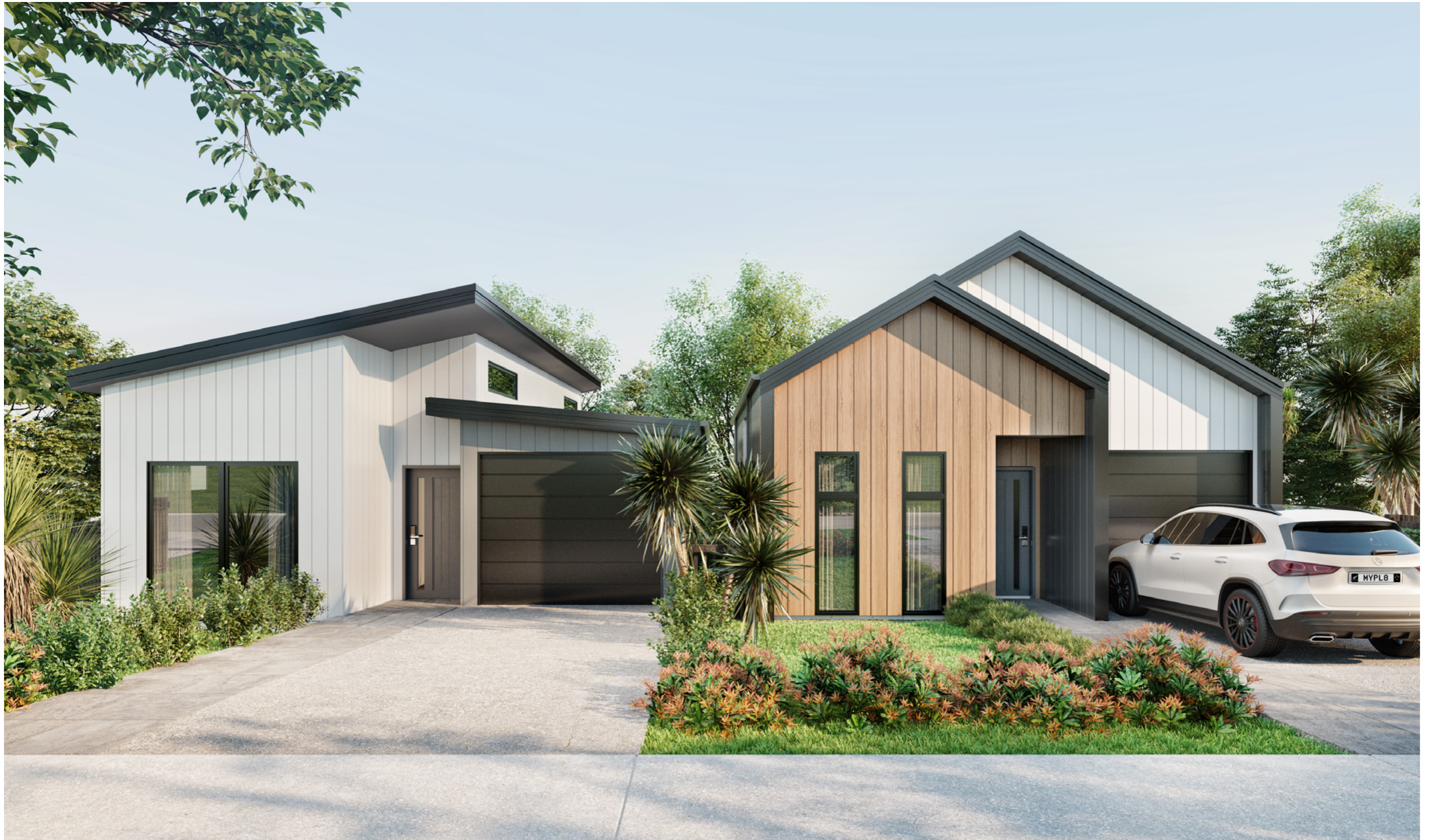
↑ Horizon Villas Stage A ( streetview )