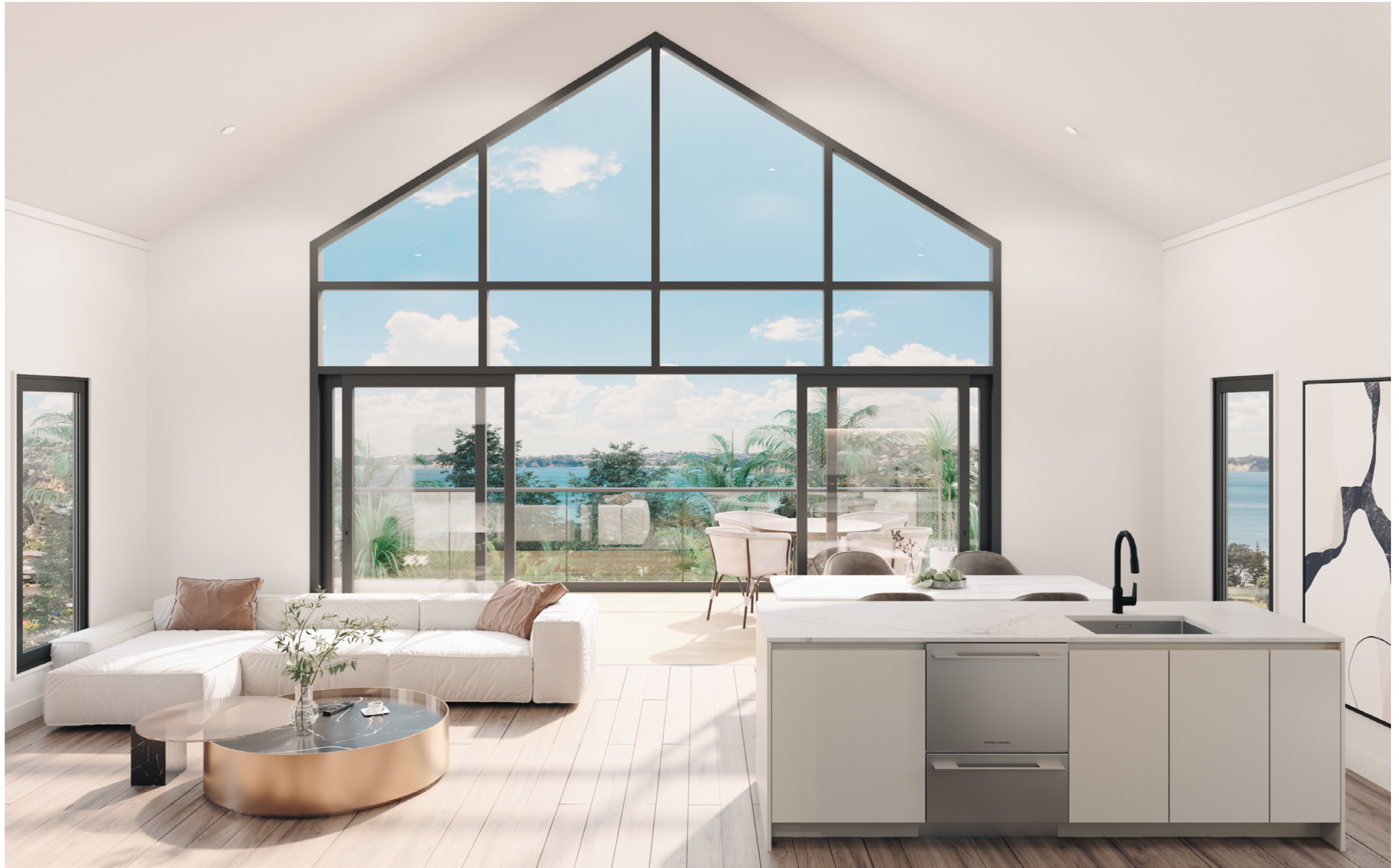
↑ Entertaining is made easy with a large open plan living space and balcony, all benefiting from ocean or bush views depending on your chosen site.