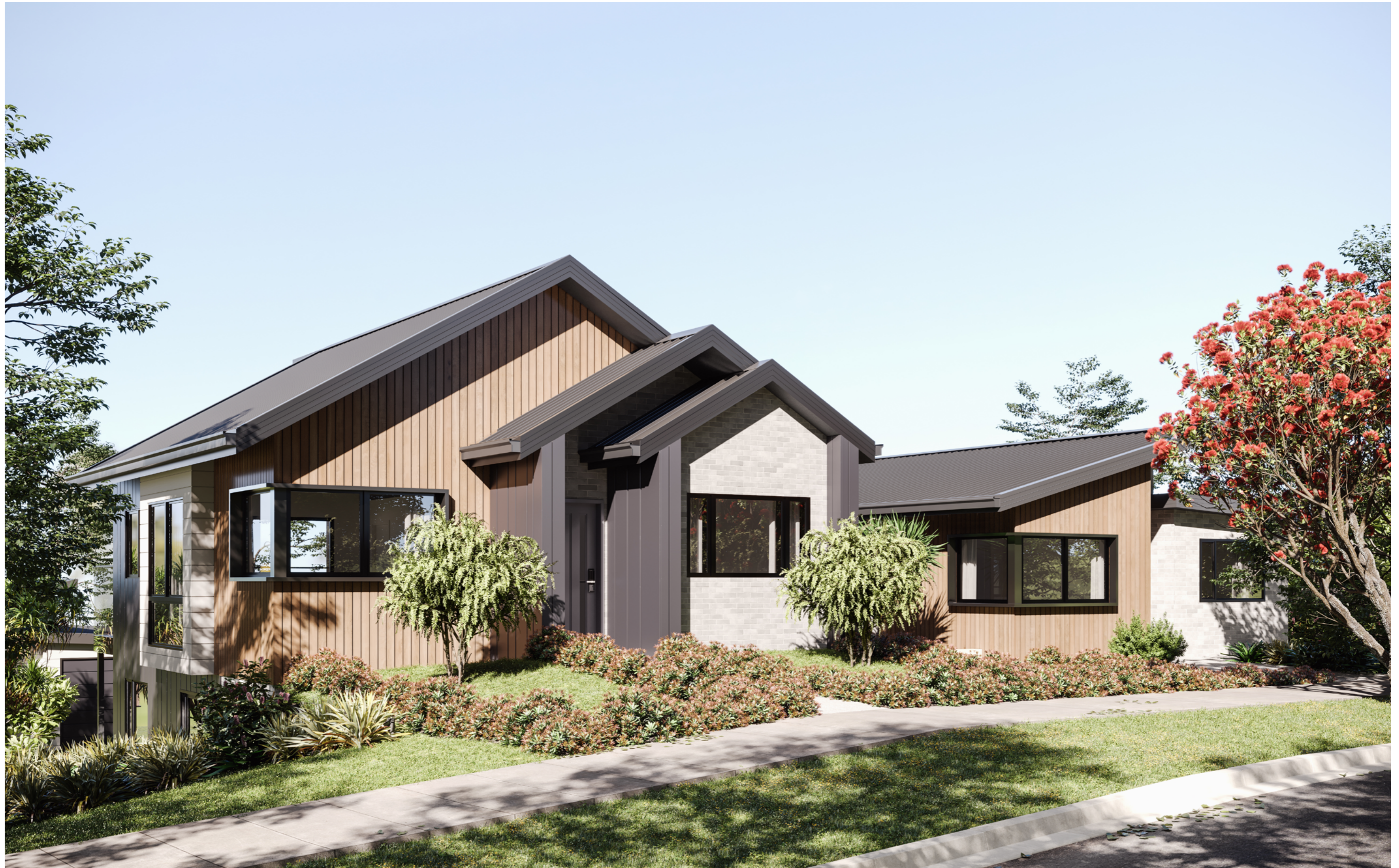
↑ Making use of long-lasting, low maintenance materials, Horizon Villas are built for effortless enjoyment.