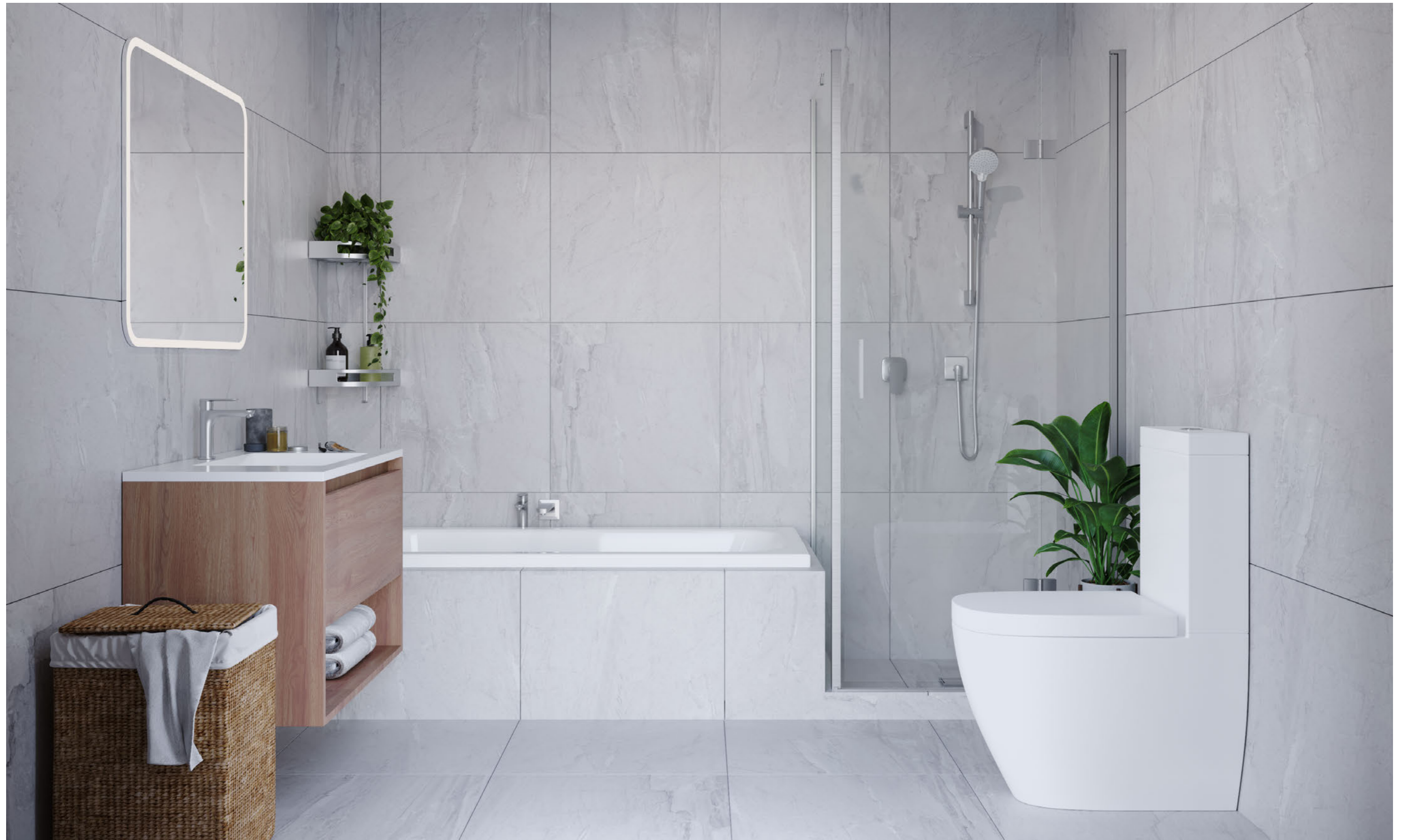
↑ Bathrooms feature a carefully curated range of quality materials and finishes that reflect a clean contemporary aesthetic.