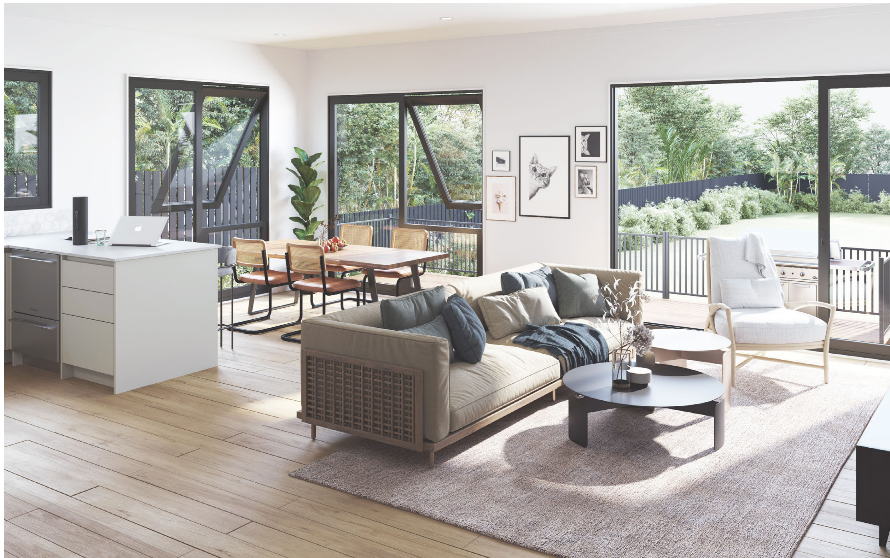
↑ Entertaining is made easy with a large open plan living space and balcony, all benefiting from ocean or bush views depending on your chosen site.